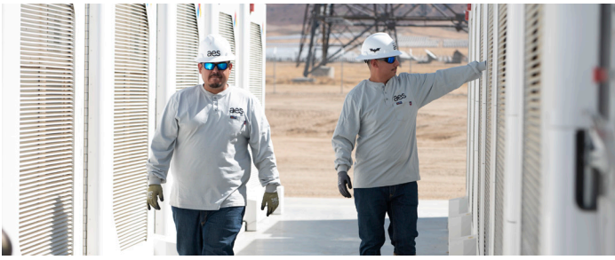
AES' Waikoloa solar-plus-storage project, Hawai'i